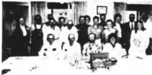
Members attending the A.C.D.H.A. meeting